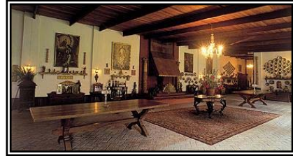
Casa Hacienda Orihuela

After lunch we will return to Cusco. Afternoon free to enjoy the city. Gala dinner; there is a wide choice of restaurants, mansions with Inca walls, monasteries, convents or private hotel rooms. Make the night unforgettable!