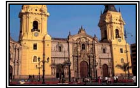
Cathedral of Lima

As the old capital of the Viceroyalty of Peru, Lima retains a lot of its colonial spirit. Today we will visit its Historic Centre, a UNESCO World Heritage Site.