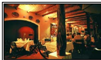
Huaca Pucllana Restaurant

Special dinner in the "Huaca Pucllana" restaurant, which specialises in Peruvian cuisine using a great variety of products: fish, shellfish and vegetables. This restaurant is located in the modern district of Miraflores and is a replica of an old hacienda, which has a view over a ceremonial centre dating from the 5th Century AD.