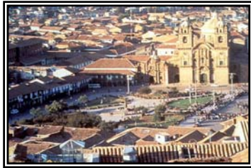
Plaza de Armas

In the afternoon we will tour the city of Cusco, which is full of Inca architecture designed for religious, administrative, military and domestic use. Cusco's colonial Spanish monuments are among the wealthiest and most luxurious in the Andes. This afternoon we will visit some of them and we will see Koricancha, which was the most important Inca temple as it was dedicated to worship of the sun. The Spanish built a church and Dominican monastery over the temple and we can see both cultures existing together.